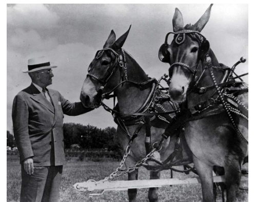
Picture of Harry Truman with mules courtesy of Truman Library and Institute